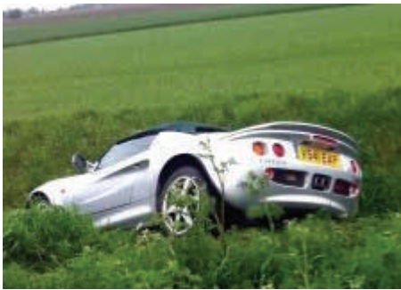
The Lotus which left the road in Tipps End.