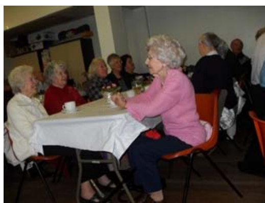
Some of the parishioners enjoying the day